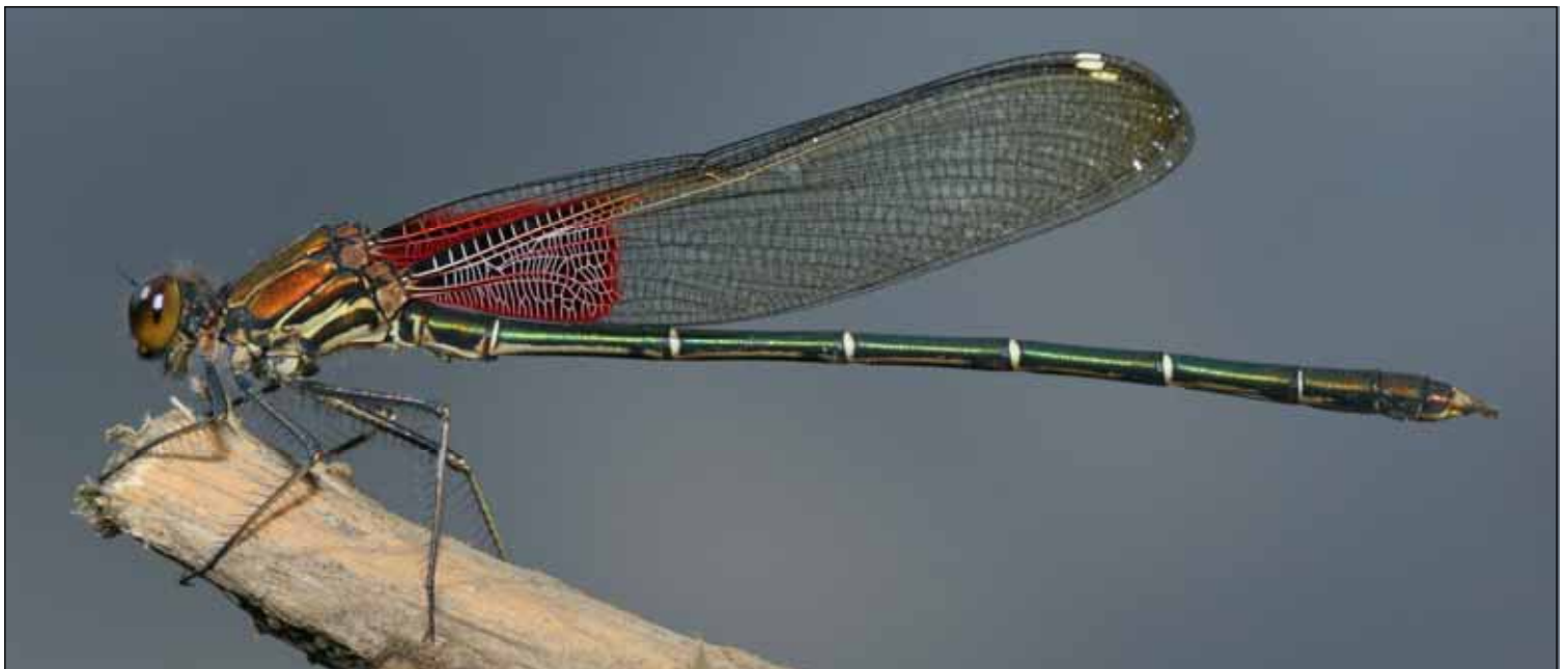
Hetaerina americana (American Rubyspot)