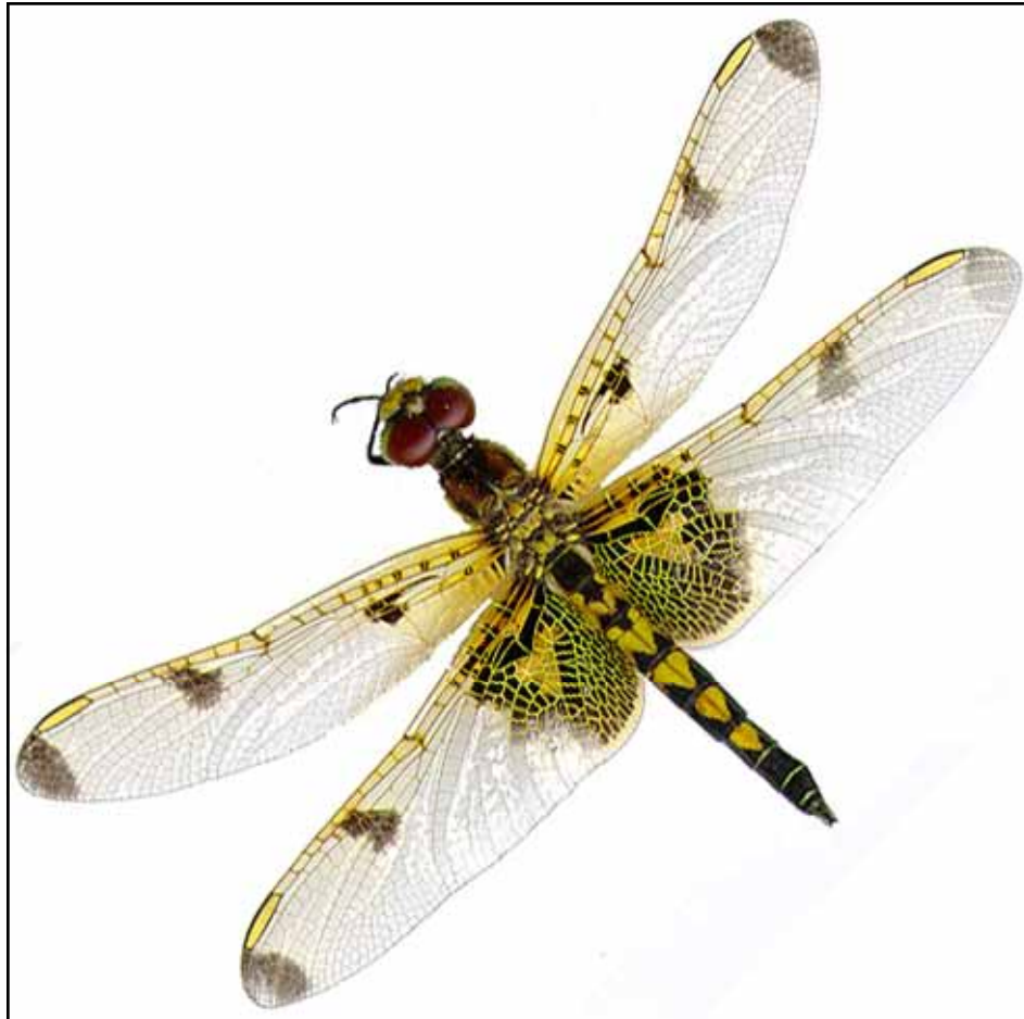
Celithemis elisa (Calico Pennant)